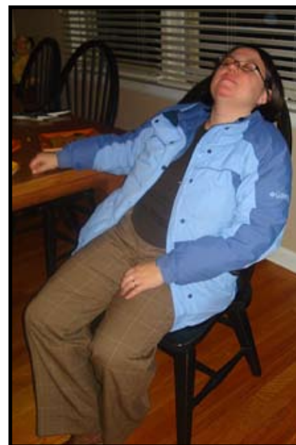
After enjoying the bonfire night party into the wee hours, this Tafia member who shall remain sort of anonymous went to bed at the kitchen table.