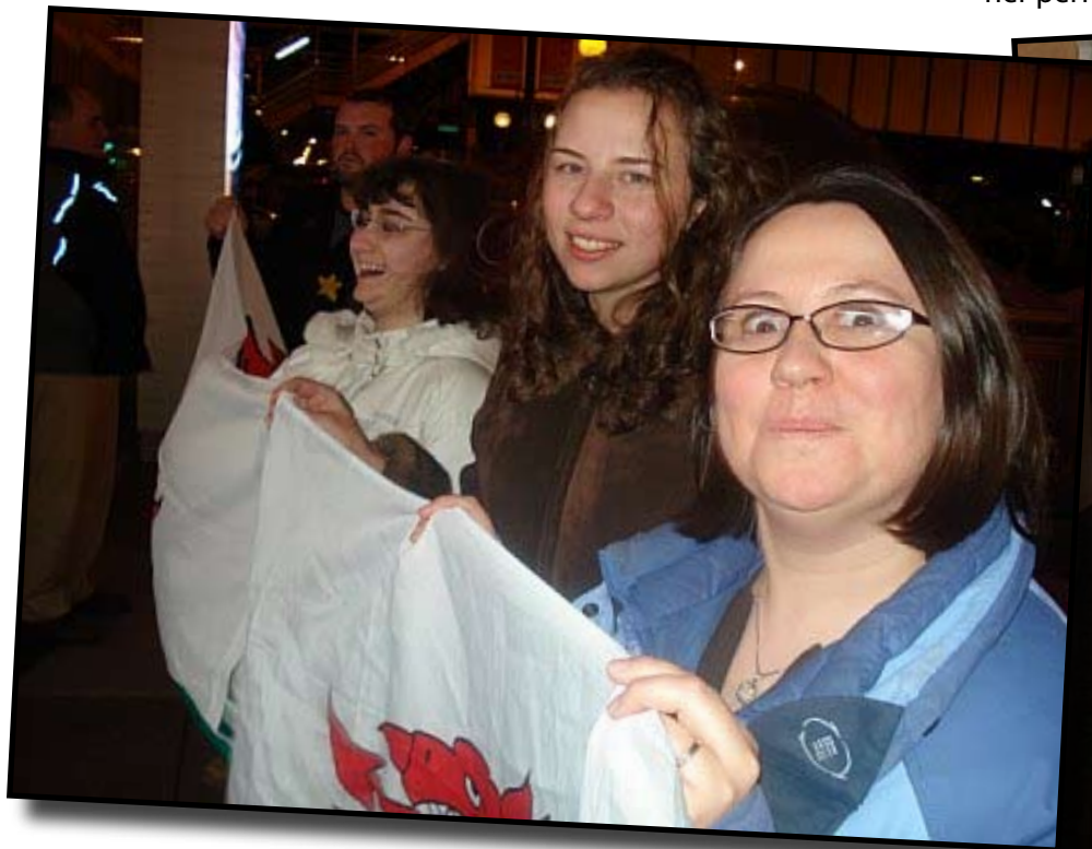
Tafia members outside Channel 7 studios in Chicago wait to be caught on camera and broadcast that it's St. David's day to everyone watching!