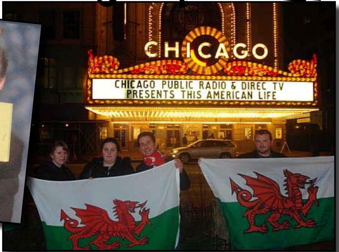
Happy St. David's Day, Chicago!