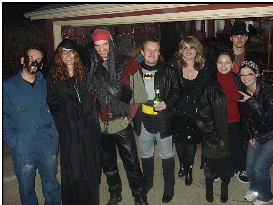
Tafia members at the November bonfire night and Halloween party dressed up and endured some pretty cold weather for the night, but it didn't put a damper on the fun!

see the Calander of Events on the last pages for info on this year's party!